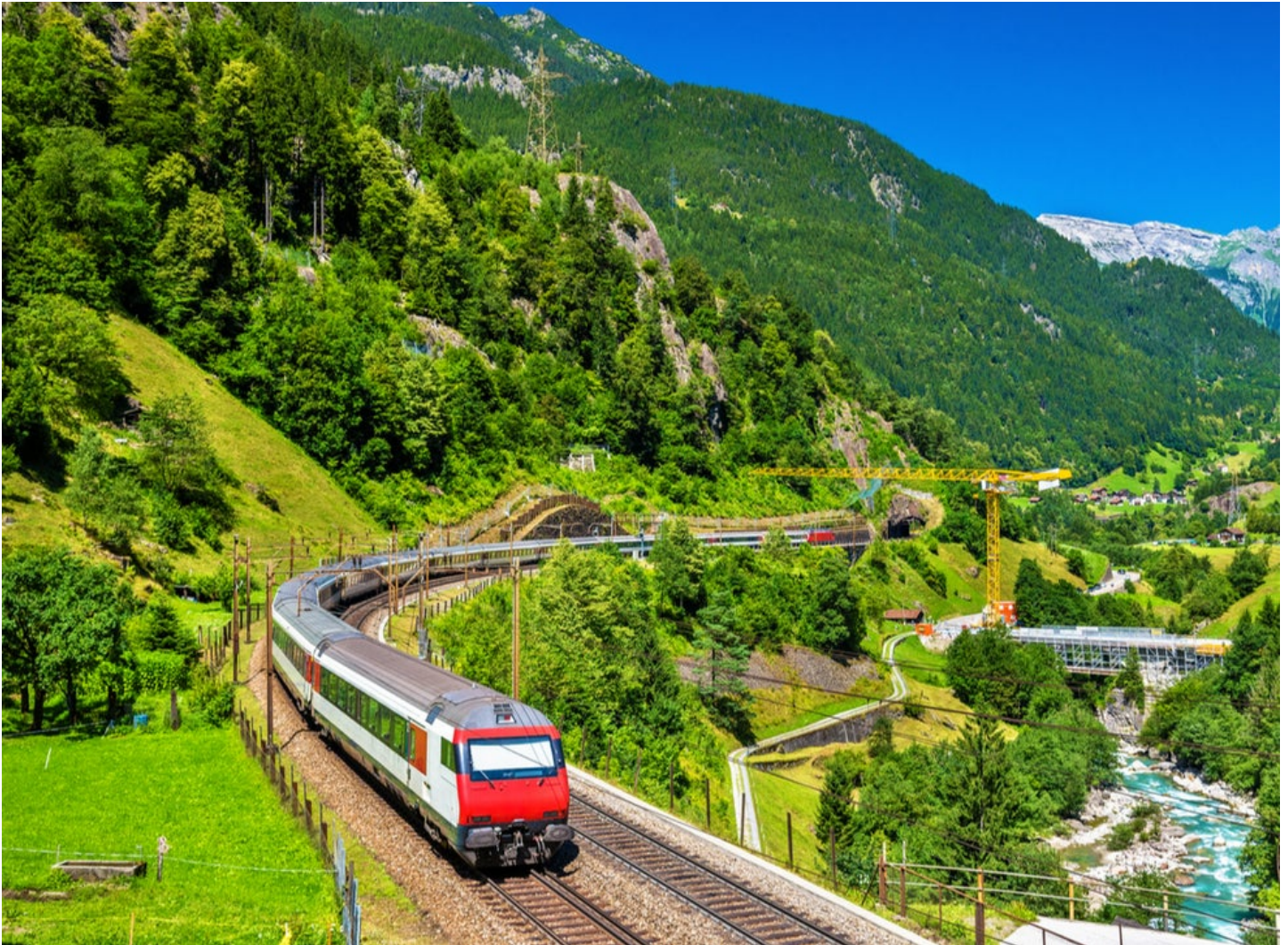
The Gotthard railway is getting a new service