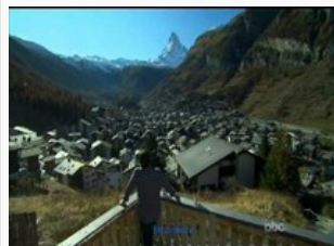
Video: The Bachelor finale preview