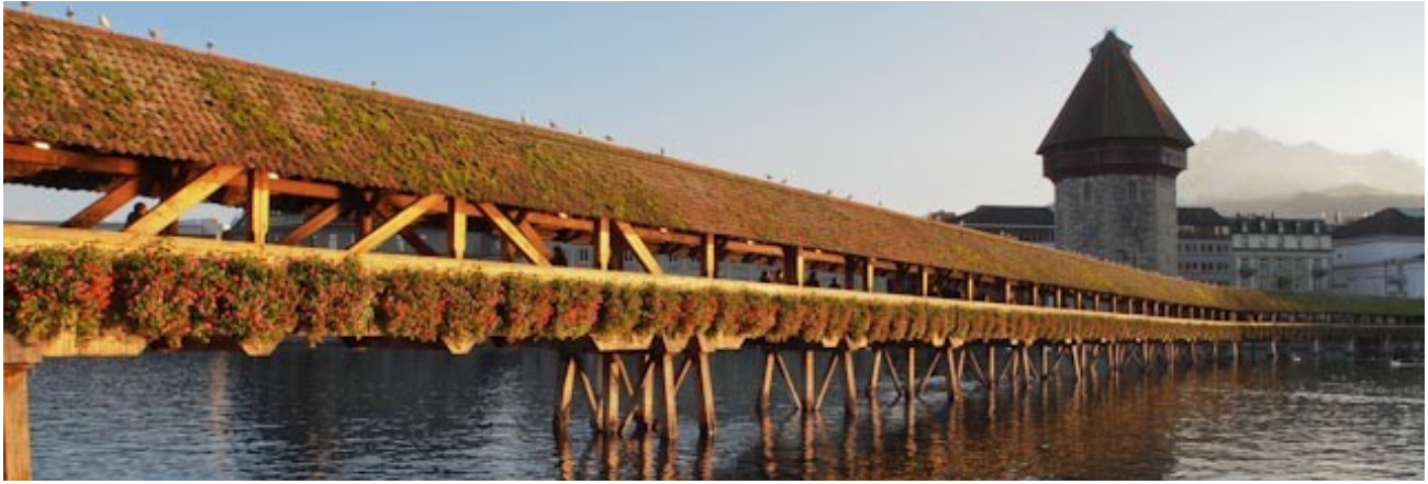
by Gary Crallé Luzern (Lucerne), Switzerland July 13, 2012