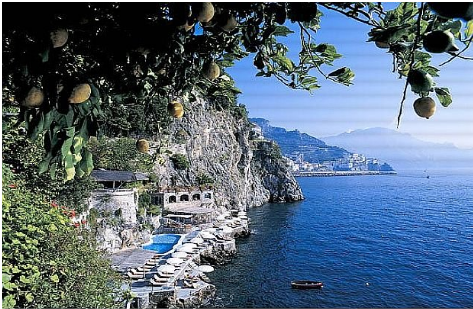
Hotel Santa Caterina

Comment | Tweet | Share | Pin it | +1 11 | EMAIL | More | Like 3