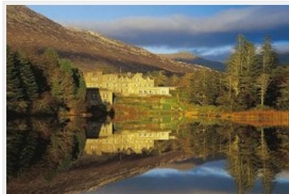
Ballynahinch Castle Hotel, Ireland

Ireland’s 4-star Ballynahinch Castle Hotel ( http://www.ballynahinch-castle.com/connemara-hotel ) proves you don’t need 5 stars to make the list. Although Ballynahinch calls itself a castle, it feels more like a luxurious hunting lodge. It is located within a 450-acre forested estate filled with woodlands and lakes in the heart of Galway.