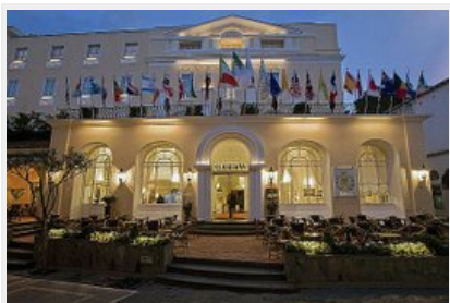
Hotel Quisisana, Capri

If you ever wondered how a Roman emperor would have lived in the 21 st century, Hotel Quisisana ( quisisana.com/en/index ) would be the place. Whether you go to the Isle of Capri for a day trip or to spend some time there, Quisisana's magnificent location is impossible to miss at the junction of the three main routes as you stroll around the island.