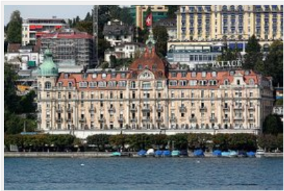
Lucerne Palace, Switzerland

Hotel Palace Lucerne ( http://www.palace-luzern.ch/en/ ) is known as “the pearl of hotels in Lucerne” for good reason. Sitting along the romantic promenade that lines the perimeter of a portion of the Lake of Lucerne, the hotel is framed amid a bowl of idyllic alpine panoramas. Lucerne’s Old Town has long been a favorite destination for travelers. Here the Lake of Lucerne flows beneath the historic landmark Chapel Bridge before it empties into the rushing waters of the River Reuss.