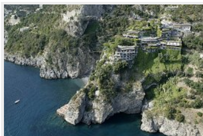
Dramatic San Pietro, Positano

Just outside Positano, CN's fourth best hotel in Italy is built within a cliff that plunges into the sea. I call San Pietro ( www2.ilsanpietro.it/en/ ) the "Invisible Hotel" because it was designed so that it cannot be seen from the road, and you really have to look for it