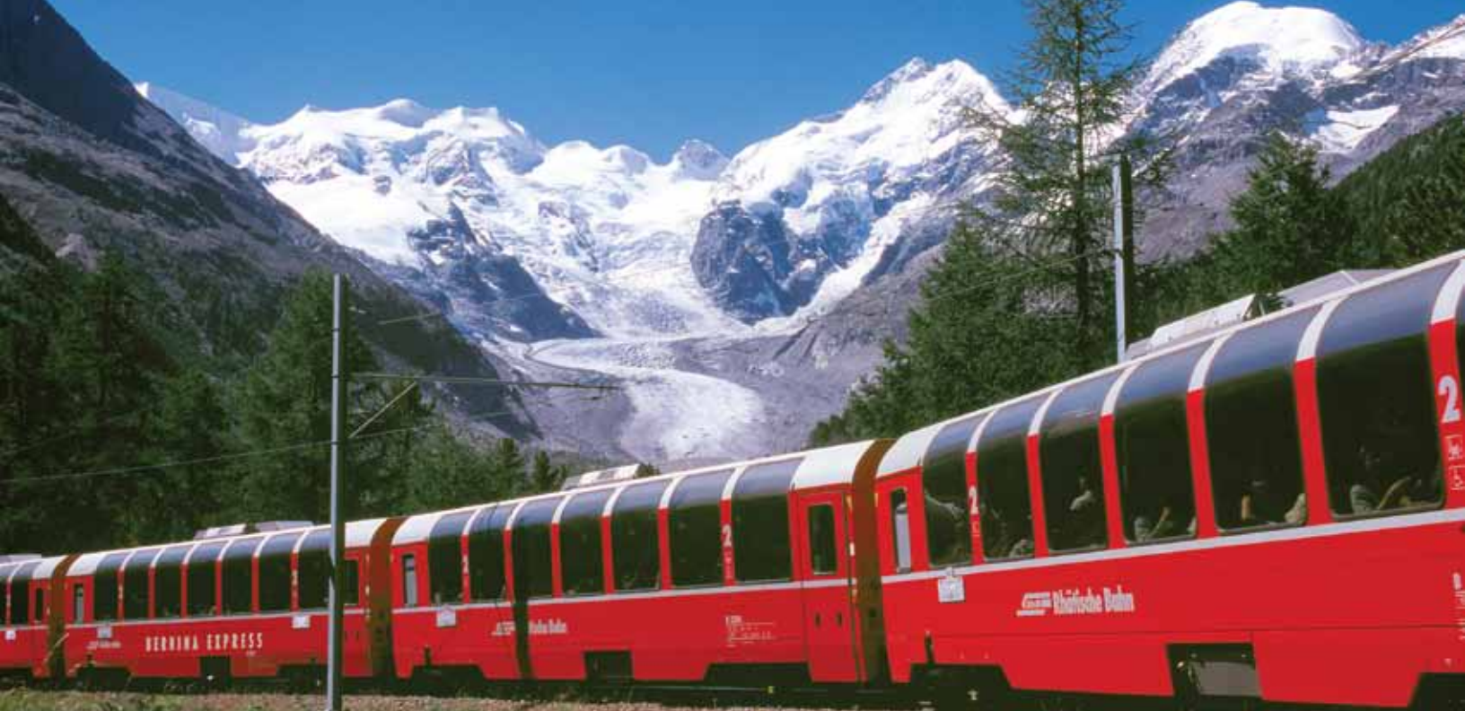
Bernina Express with Morteratsch Glacier