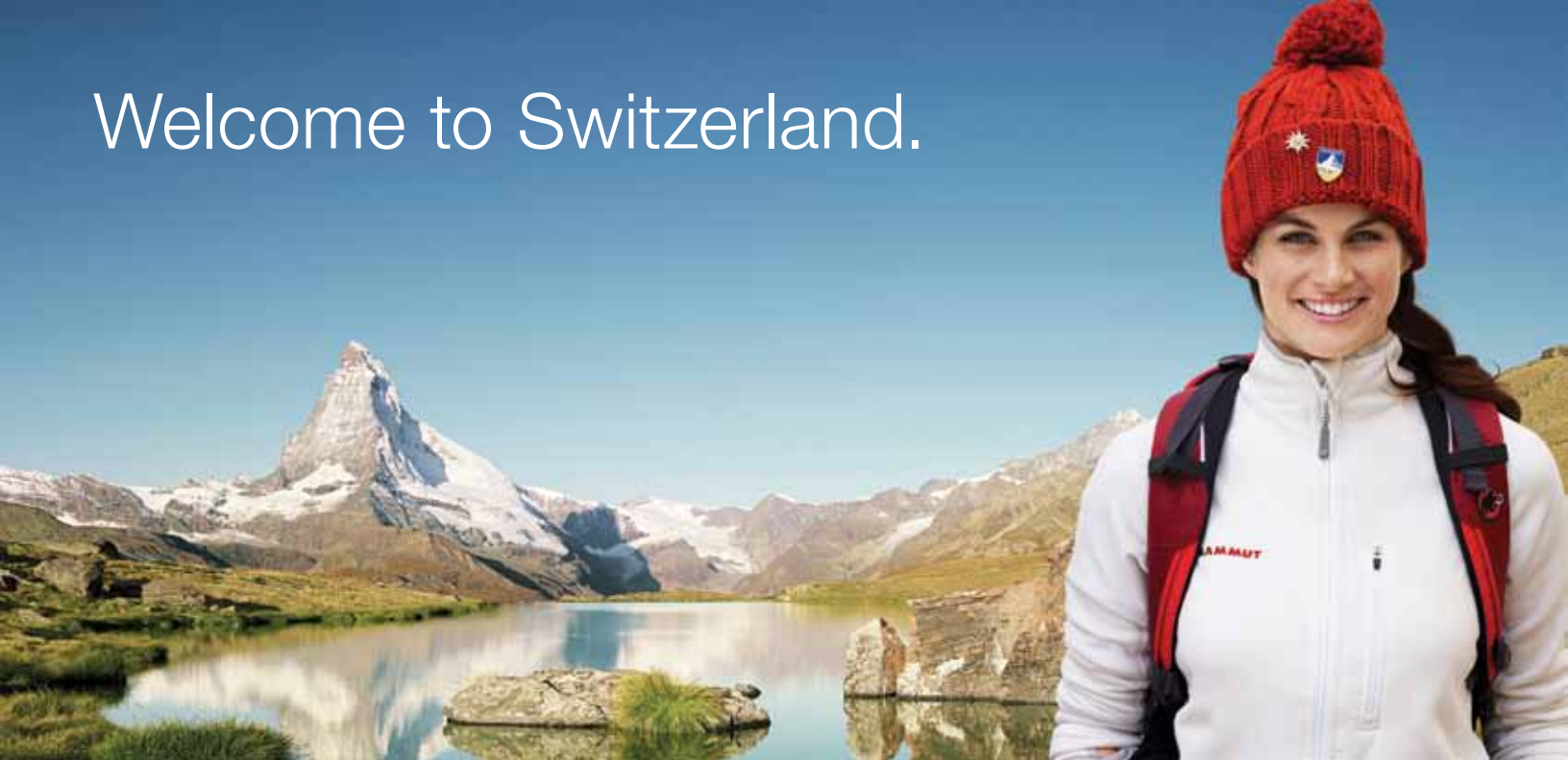
Lake Stelli and Matterhorn, Zermatt