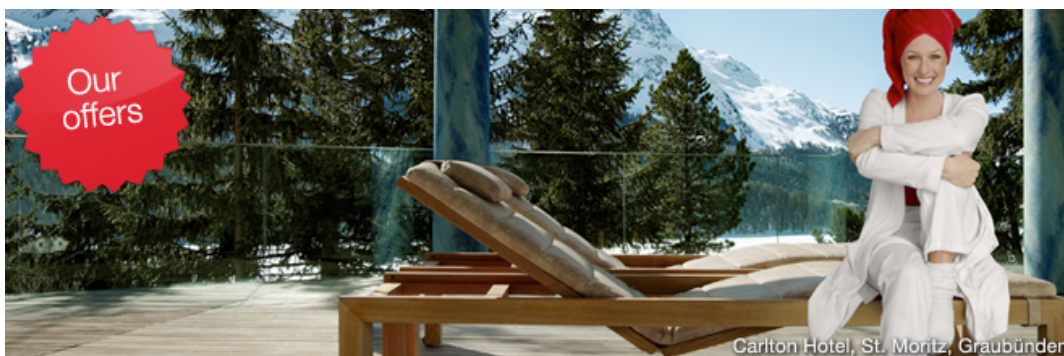
Carlton Hotel, St. Moritz, Graubünden