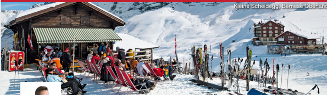
Kleine Scheidegg, Bernese Oberland