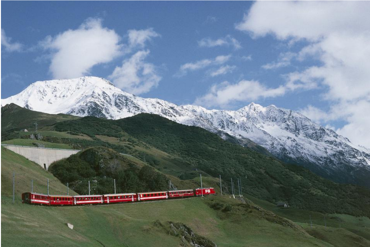
The Glacier Express train

Switzerland's Glacier Express is one such train. The train snakes through the country's iconic alps, on a direct, 8-hour-long, 186-mile voyage from the alpine town of Zermatt (home to the Matterhorn) to the ritzy ski resort town of St. Moritz (or vice versa). The Glacier Express offers an unparalleled opportunity to see a side of Switzerland many tourists (and even locals) might never see. Here are some of the reasons you should put the Glacier Express on your list of must-dos once travel resumes.