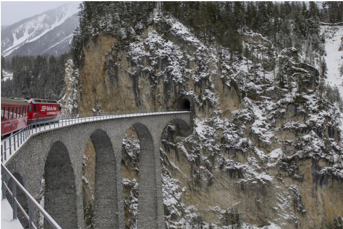
Landwasser Viaduct at the Swiss Alps

On the voyage you'll also go through the Domleschg valley, famous for its ruins and ancient castles. Before you reach St. Moritz, be sure to keep your eyes peeled for the amazing Landwasser viaduct. Supported by five stone pillars and measuring 465 feet long, the views atop the viaduct are heart stopping.