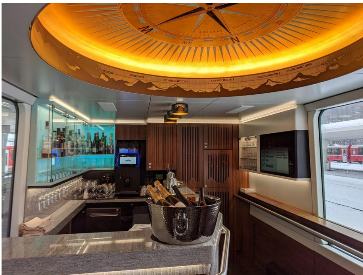
The bar and remarkable compass aboard the Glacier Express SANDRA MACGREGOR

Though the Swiss sometimes have a reputation as reserved, the service aboard the train is warm and friendly. Not only is the staff solicitous but they are very well informed about the sites and are happy to answer any questions. To ensure that your journey is as edifying as it is entrancing, guests are provided with a tablet that charts their journey in real time. Information about each area you pass through helpfully pops up on the screen, complete with sight-seeing suggestions for future travel. A well-stocked bar gives you the perfect excuse to stretch your legs and go for a walk. Grab a seat at the counter to take the opportunity to meet other passengers. Make sure you look up to see the giant whimsical compass that actually moves to track the train's headings.