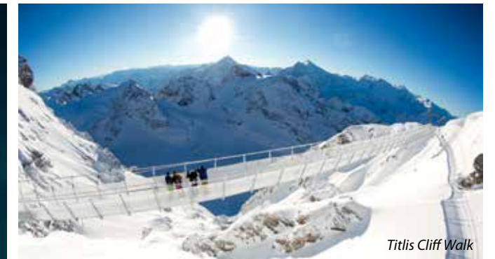
Titlis Cliff Walk

As one of the Central Switzerland's hidden gems, the Swiss Alpine village of Engelberg and the Mount Titlis glacier is a convenient excursion from the major cities of Zurich and Lucerne. Engelberg – meaning the “mountain of angels”, is originally founded by a Benedictine monk. This area is now a famous winter wonderland filled with many attractions and memorable experiences.