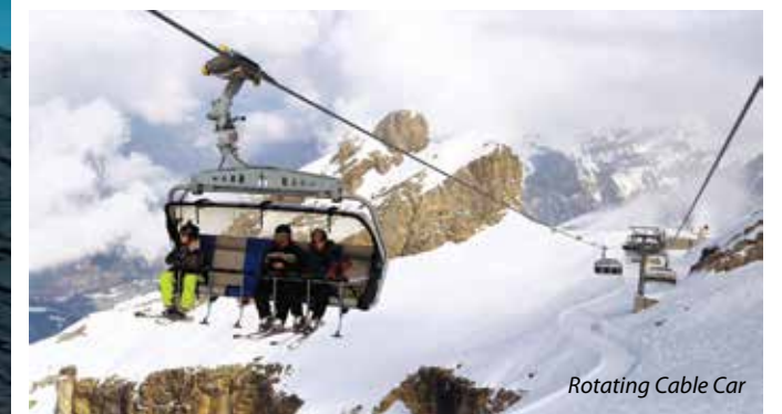
Rotating Cable Car

At the frosty heart of the Titlis glacier, a magical world awaits. The Glacier Cave in Mount Titlis is 20 metres below the glacier's surface. The natural blue colour, due to the light's refraction, illuminates the 150-metre-long walkway of frozen ice. The temperature inside the cave is regulated at frosty -1.5°C. Exploring the glacier cave is an amazing experience!