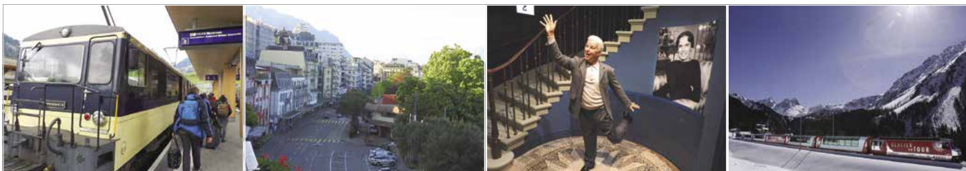
Left to right; Boarding for Montreux - Montreux - Inside Chaplin Mansion - Glacier Express