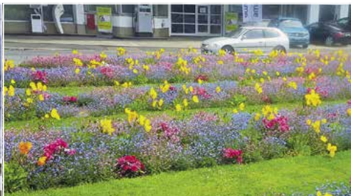
Left to right; Station at Oberalp Pass and colourful gardens Vevey

Over many centuries the River Rhine has carved a path through the tough bedrock. The result is one of Switzerland's most impressive natural spectacles. The landscape looked very dramatic as the Rhine River carved its way deep into the white rocks, accentuated by the wild waters tumbling aggressively below.