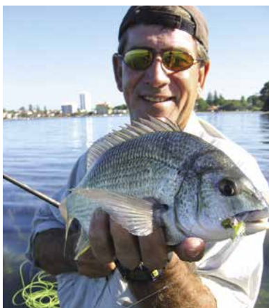
It's been some years since I've kept a fish from the Swan