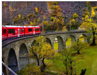
Swiss Travel Pass [2020] - Switzerland's All-in-One Transport Pass