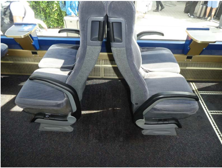
Luggage can be stored between the backs of the seats on the GoldenPass Line.

I hope this guide to the GoldenPass Line has helped you to plan your journey. It truly is one of the most scenic Swiss train rides with spectacular scenery on every leg of the trip.