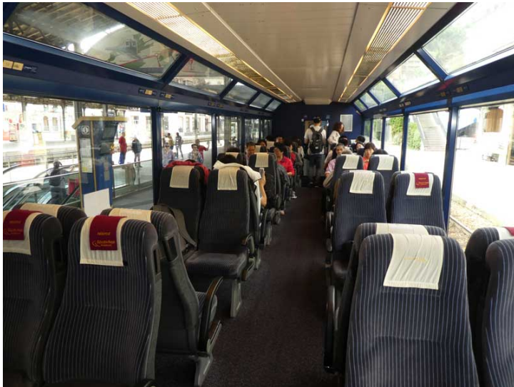
Seats that have already been reserved on the GoldenPass Line are indicated by a red cloth.

However, if you would like the best view in the house (or in this case in the carriage), it's a good idea to book ahead.