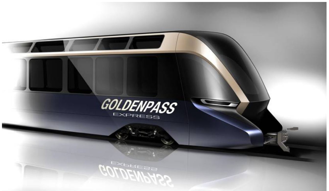
📷 The Goldenpass Express, which will go into service on 13 December 2020, designed by Italian company Pininfarina.

For the train has been styled by Pininfarina, one of the world's most prestigious design companies. This legendary company has been in business since 1930 and