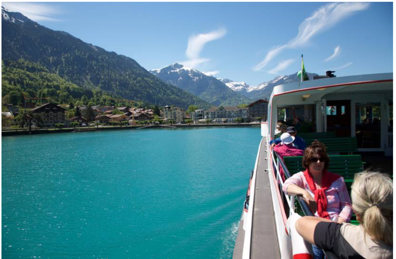
📷 Boat travel is included in passes. Interlaken, Switzerland.